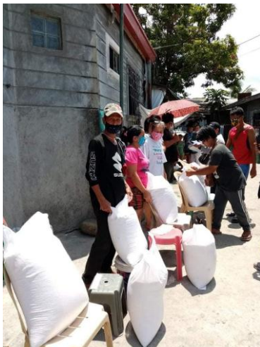
Figure 2: During the Distribution of Rice

outside their gates so that the packed goods will be placed on it as the proper social distancing was being observed.