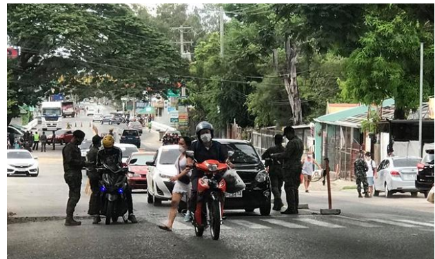
Figure 6: Subic, Zambales