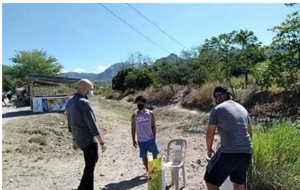
Figure 1: During the Distribution of Rice