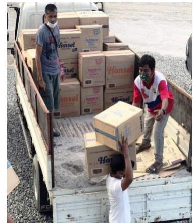
Figure 4: Members of the Zambales IATF deliver food supplies for frontline offices

Meanwhile, Zambales Governor Hermogenes Ebdane Jr. has ordered the Provincial Inter-Agency Task Force on Covid-19 to implement a six-point strategy that intensifies efforts to manage the current crisis we are encountering. The provincial strategy, the governor explained, includes the establishment of quarantine facilities at the south area, Subic Zambales where all new arrivals will be detained for 14 days and will set-up quarantine facilities in each municipality for this purpose. (Vizcocho, 2020)