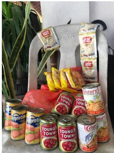
Figure 3: Relief Goods