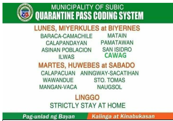
Figure 5: Quarantine Pass Coding System in Municipality of Subic, Zambales.

Due to the Enhanced Community Quarantine being implemented throughout Luzon, beginning Monday, March 30, 2020, the QUARANTINE PASS CODING SYSTEM will be implemented throughout Subic, Zambales. This is to limit the number of people who come to our People's Market, Grocery stores, Pharmacy and more. This way we can maintain that our beloved Subic town is COVID-19 Free.